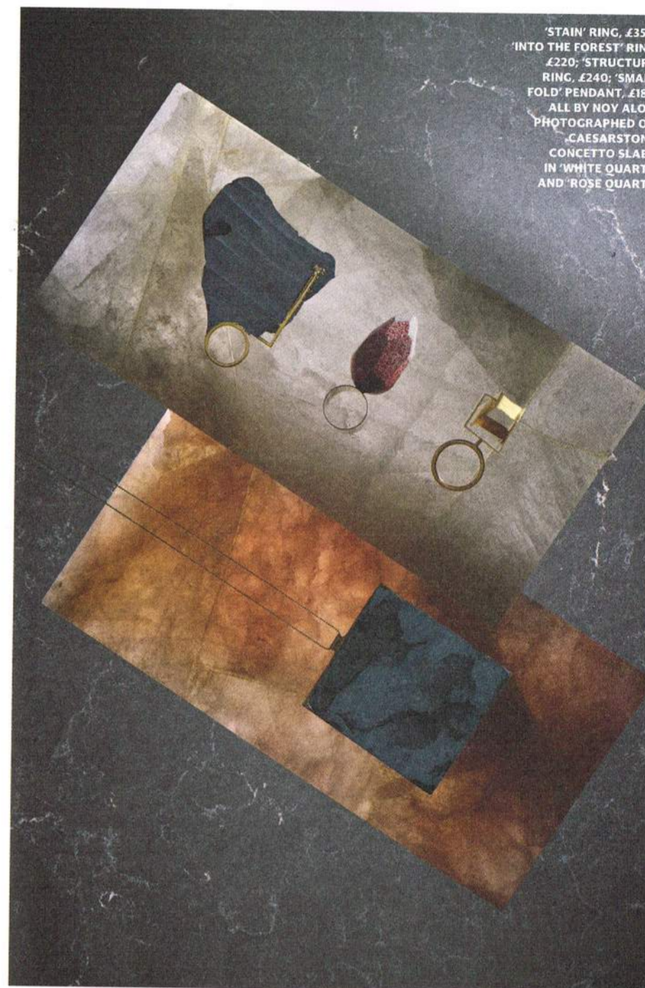
'STAIN' RING, £350; 'INTO THE FOREST' RING, £220; 'STRUCTURE' RING, £240; 'SMALL FOLD' PENDANT, £180. ALL BY NOY ALON, PHOTOGRAPHED ON CAESARSTONE CONCETTO SLABS IN 'WHITE QUARTZ' AND 'ROSE QUARTZ'

Designed by Andrey and Shay, these form part of a collection that includes a large table mirror and a wall mirror.